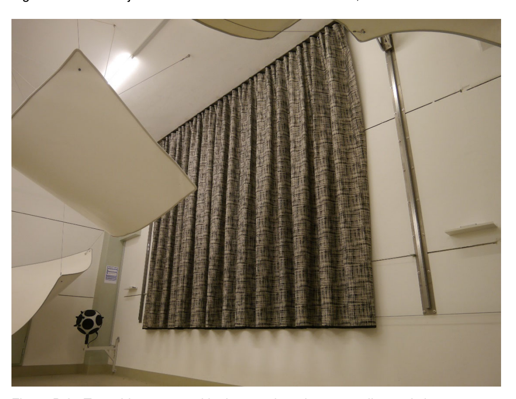
Figure B.2. Test object mounted in the reverberation room, diagonal view.